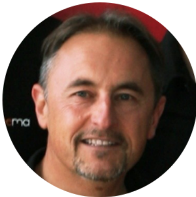
🏠 Wind Energy Gandalf, Wind Sports 🏆